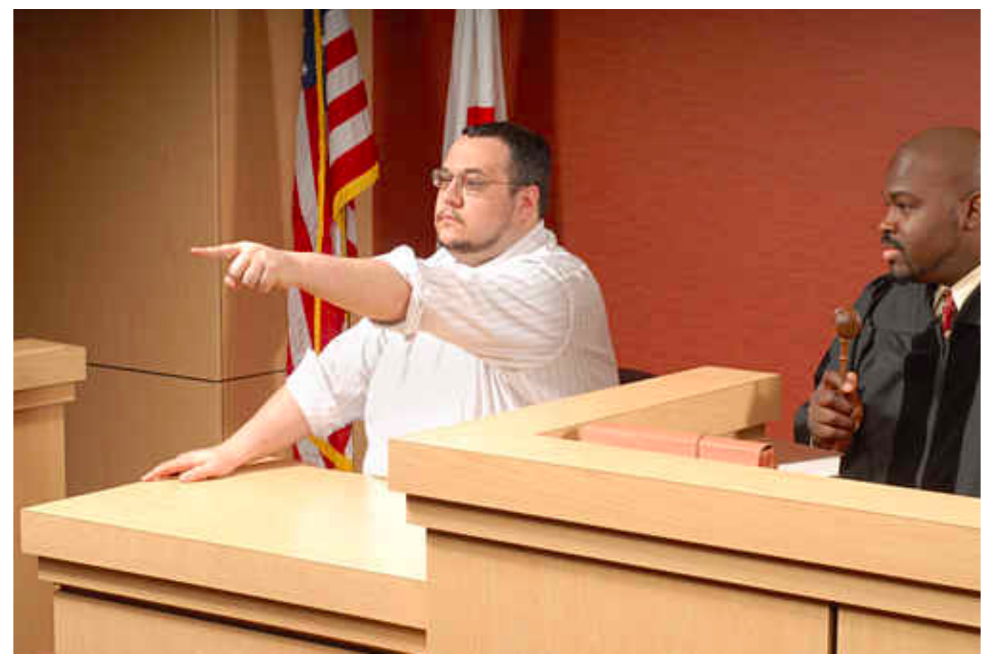
Witness points at defendant in courtroom.