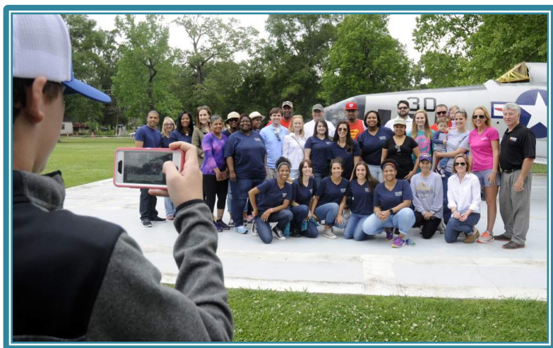
BRAVE Community Event East Baton Rouge, Louisiana

SEEKING JUSTICE THROUGH COMMUNITY PARTNERSHIPS AND INNOVATION