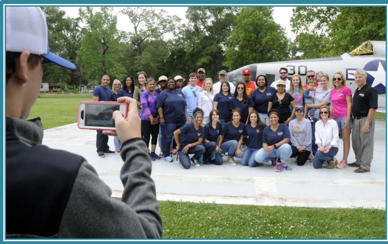
BRAVE Community Event East Baton Rouge, Louisiana

SEEKING JUSTICE THROUGH COMMUNITY PARTNERSHIPS AND INNOVATION