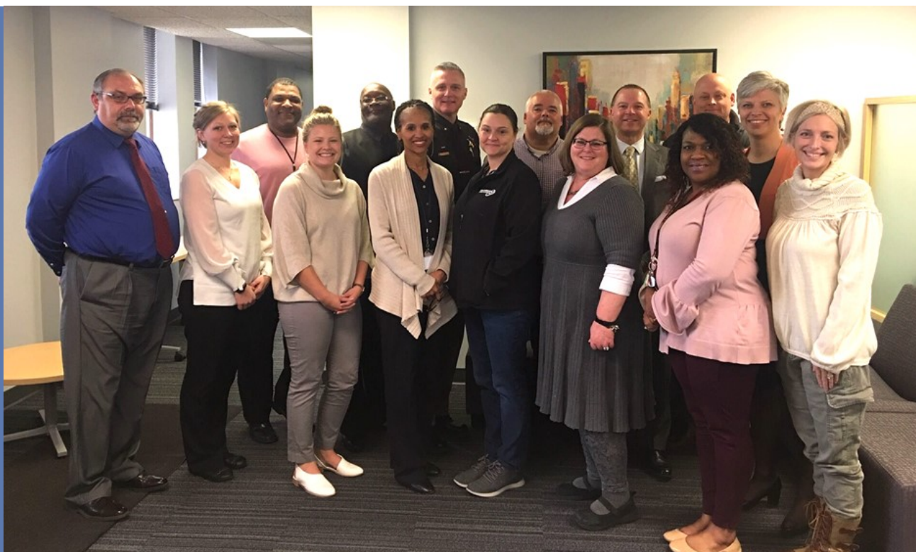
Representatives from the Administrative Team of EXIT, Muskegon County Public Defender's Office, Sheriff Michael Poulin, Muskegon County Sheriff's Office, State Probation, Muskegon

The results have been outstanding. Over 300 participants have entered the program since 2014 and over 90% have completed both Phase 1 and 2, leading to an employment rate of over 60%. More importantly, the recidivism rates for program participants are remarkably low— for those who completed Phase 1, the re-incarceration rate is 16%. For those who completed Phases 1 and 2, the re-incarceration rate is even lower at 14%. In comparison, those who did not complete Phases 1 or 2 experienced a re-incarceration rate of 75%. These positive results demonstrate the value of investing in proactive programs and are a prime example of how prosecutors can take the lead on criminal justice programs and showcase the results to all levels of government.