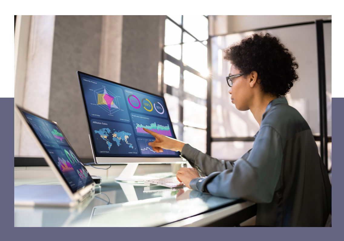
Thank you for participating!