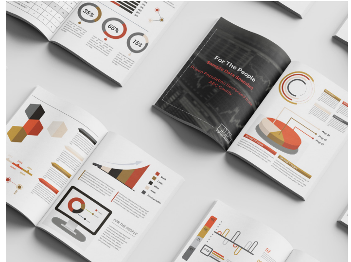
Example of County Data Snapshot Report produced by For The People

As groups of cases are reviewed and resentenced, this process should be continuously repeated to have regularly updated analyses of the prison population dataset and to consider additional criteria to identify cases for review and resentencing.