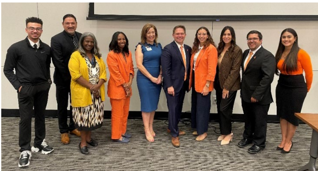
Lake County Gun Violence Prevention Initiative Group