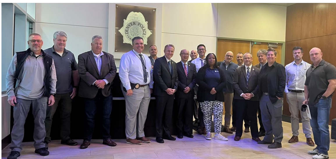
RCAO and Non-Fatal Shooting Initiative Partners Visit Denver F.A.S.T Unit

The RCO has funding for this project through a $2 million grant from the Ramsey County Manager. The money provides resources for the Sheriff’s Office, adds forensic scientists who can analyze non-fatal shooting evidence, and supports victim and witness emergency funding.