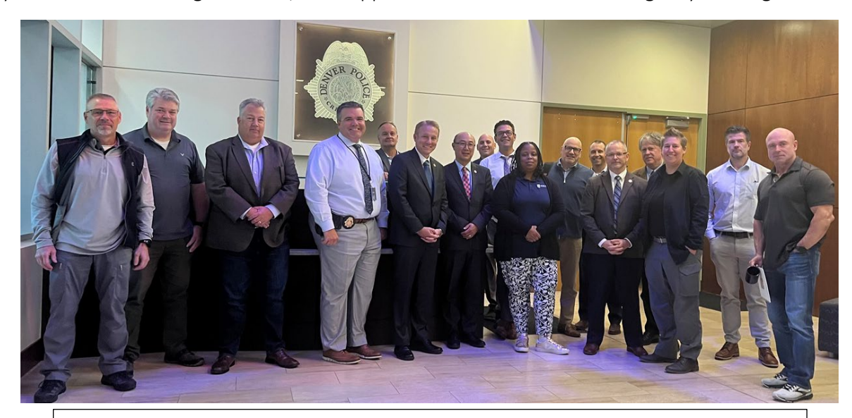
RCAO and Non-Fatal Shooting Initiative Partners Visit Denver F.A.S.T Unit

The RCAO has funding for this project through a $2 million grant from the Ramsey County Manager. The money provides resources for the Sheriff's Office, adds forensic scientists who can analyze non-fatal shooting evidence, and supports victim and witness emergency funding.