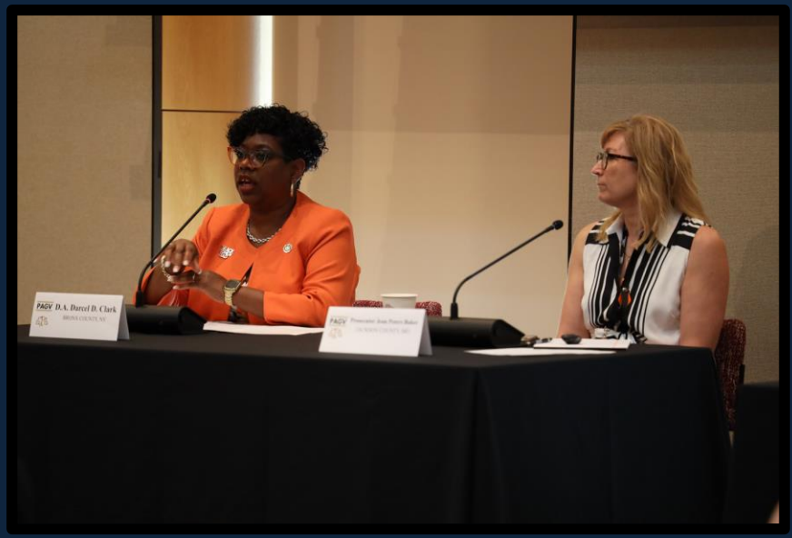
2024 National Conference Held in Bronx, NY “Prosecutors and the Other Pandemic: Preventing Gun Violence, Restoring Communities”